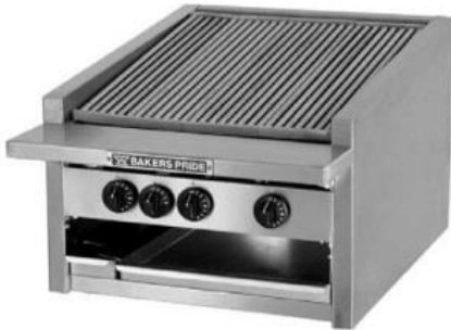
Model L-24R with floating rod top grates and optional 4" legs